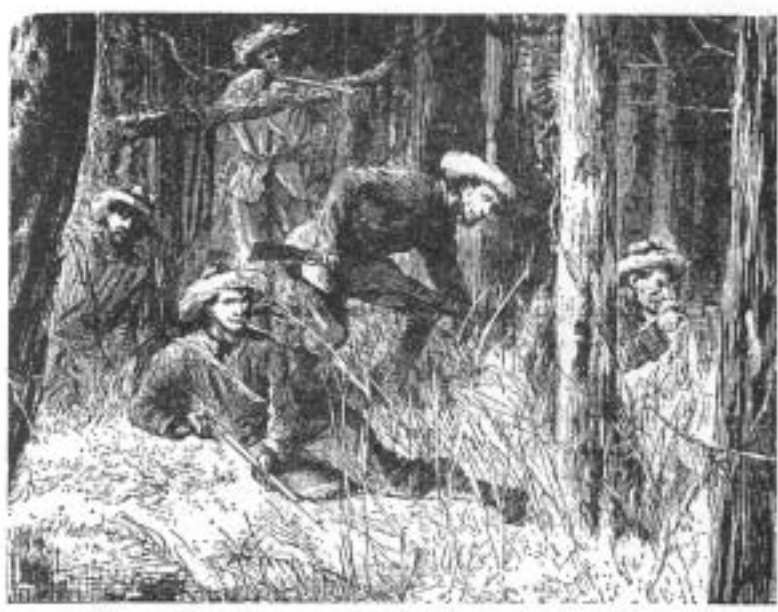
Henry Berry Lowry and His Gang in the Swamp

servatives lost control of the legal means to inflict violence, they shifted easily into extralegal means. A law and order position meant that Republicans had positioned themselves to be equally opposed to any kinds of popular rebellion or direct action, or for that matter Black or Brown self-defense. Locally, however, the Party's base constituency was overwhelmingly supportive of the popular vengeance and collective theft represented by the Lowry gang, and so the Party was conflicted.