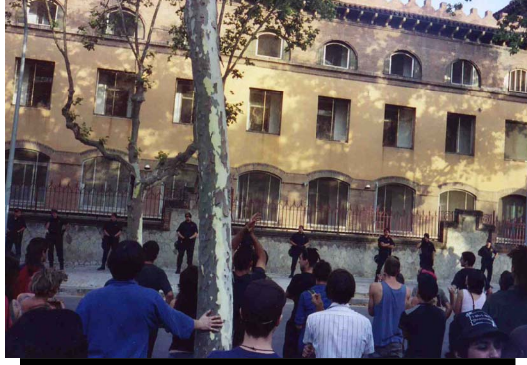
June 2005 - Barcelona, Spain: Anarchist prisoner solidarity demonstration

One Thousand Emotions PO Box 63333 St. Louis, MO 63163 USA